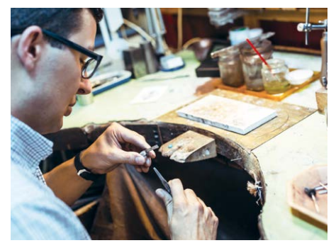
Cleaning in the jewellery industry (e.g. necklaces, earrings, bracelets, rings, etc.)

Elmasonic xtra ST devices are rated for continuous operation under the highest operational demands. The tanks are made of special stainless steel, which makes them robust with a long service life. In single-shift operation, they are guaranteed a warranty period of three years.