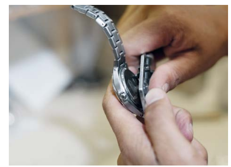
Cleaning in watch manufacture (e.g. bottom cases, watch straps, etc.)