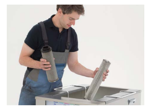
Industrial parts cleaning in workshops, production and servicing as well as for overhaul cleaning