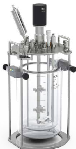
For example HABITAT ferment dw 5 for 5 liters

Now you can complete your control unit package with the matching vessels: In addition to the control unit package, you order the matching vessel package according to your application and your working volume. And you're ready to go.